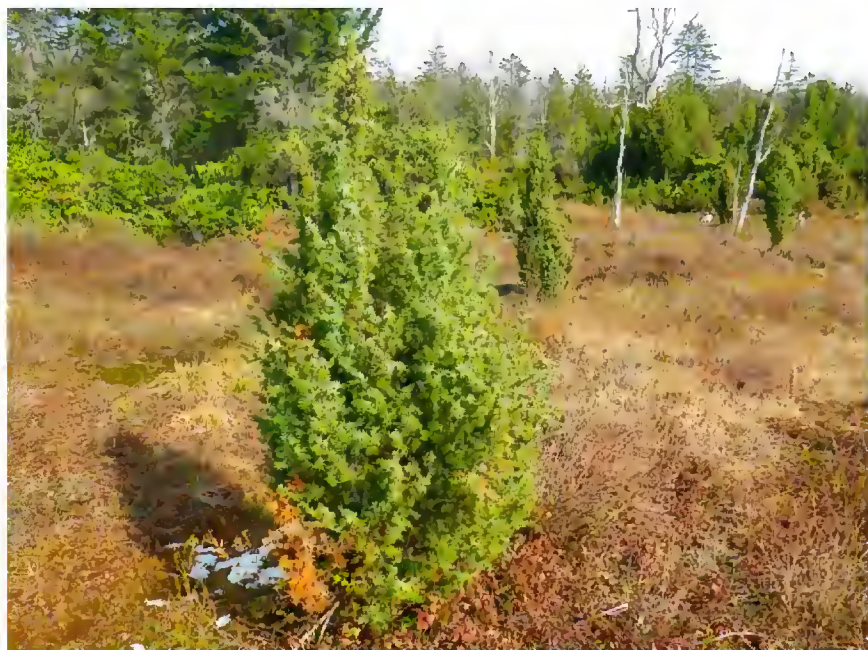
Fig. 3. var. communis , Otter Creek, WV

Figures 3-8 show verified J. c. var. communis from West Virginia and Maine.